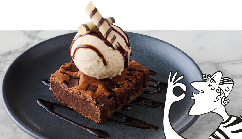
Double Belgian Chocolate Brownie

Something very special. Honeycomb and mascarpone cheesecake with smooth caramel and chocolate, all on a rich biscuit base. Served with vanilla gelato